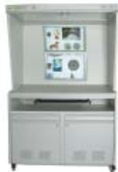
The EVS-3552/SP can accommodate up to two 30" LCD monitors.

The single or dual LCD's (not included) can easily be positioned for optimal viewing since each mounting arm allows full swivel, tilt, or pull-out (for calibration) adjustability of the LCD. Also included is the GTI LiteGuard II viewing system monitor (indicates when unit is warming up and when unit needs to be relamped).