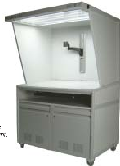
EVS-3552/SP shown with single LCD mount.