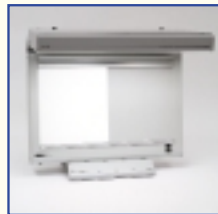
TRV-1e without side walls