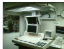
Installed on Goss Console