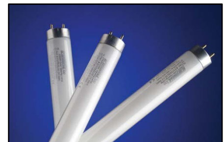
GTI lamps are manufactured with proprietary fluorescent phosphors that are unequalled by any other lamp in the industry. They produce a true full spectrum white light which renders colors with the highest degree of accuracy, color rendering, and efficiency.