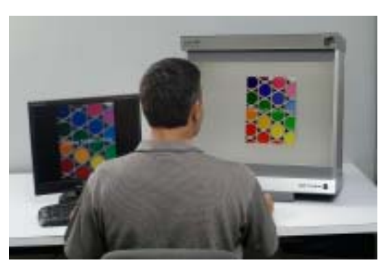
Soft View Model SOFV-1xi is the ideal viewer for color critical soft proofing applications.

The SOFV-1xi includes a number of innovative design elements including adjustable light shields for both upper and lower luminaires to enable you to optimize the viewing experience, a steel viewing surface to allow the use of magnets (included with unit) to precisely position artwork, and easy access controls mounted on the front panel.