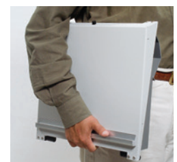
GTI's PPVS-2e model is foldable for portability and easy storage.

GTI is a leading manufacturer of tight tolerance lighting systems for critical color viewing and product inspection. An in-house spectroradiometric laboratory and a 100% measurement and verification production process guarantees that precision and accuracy is built into all products. All products are shipped with a certificate of product conformance.