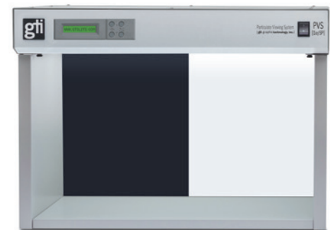
PVS-1e/SP with digital dimming option.

PVS-1e and PPVS-2e systems feature preset step dimming which is manually controlled with rocker switches. The PVS-1e/SP model features optional digital dimming for precisely setting any desired degree of illuminance up to 4000 lux.