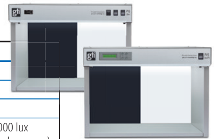
PVS-1e with manual step dimming and PVS-1e/SP with digital dimming.