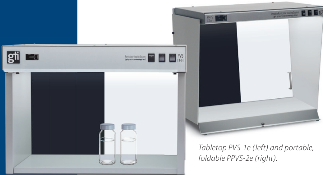
Tabletop PVS-1e (left) and portable, foldable PPVS-2e (right).

Tabletop Systems for Visually Detecting Particulate Contamination