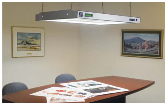
Above: GLE luminaires have a thin profile that is ideal for conference rooms and design studios.