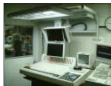
Installed on Goss Console