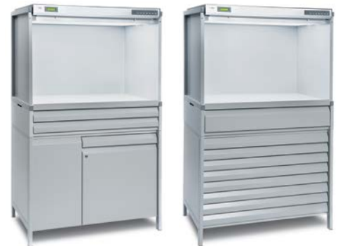
CMB-2540 shown with two shallow flat file drawers and storage cabinet at left; and shown with one deep file drawer and eight shallow flat file drawers at right.