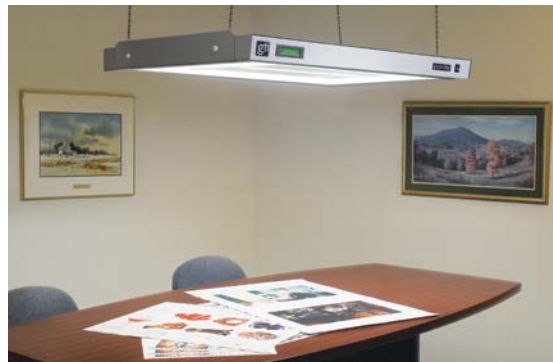
Above: GLE luminaires have a thin profile that is ideal for conference rooms and design studios.