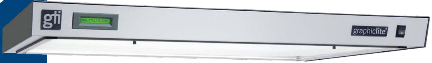
Above: GLE-532 with optional LiteGuard

For Superb Light Uniformity Over a Large Area