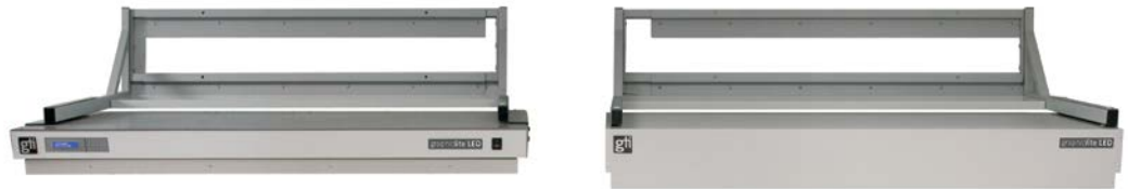
GTI's GLE/LED/V (left) and GLL/LED/V (right) series luminaires, shown with wall brackets, are available in four and five foot models. GLE luminaires have a front power switch and a power cord which plugs into a standard outlet. GLL luminaires must be hard wired into a switched power circuit.

GTI's custom Munsell N8/neutral gray panels are mounted to the wall. Panels up to four foot by eight foot are available. For larger areas, multiple panels can be placed edge to edge. Panels feature a steel viewing surface to allow the use of magnets (included) to hold artwork. Munsell N8/ neutral gray paint is available for background walls.