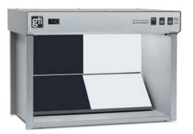
45 degree and variable angle viewing tables are offered in neutral gray or in black and white to match the booth.