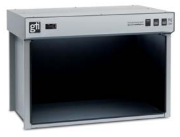
Insert panels are available to create an all matte black or all non-glare white booth interior.