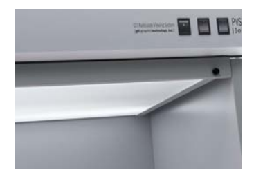
A prismatic diffusion lens is available as an option.