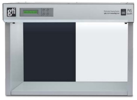
PVS-1e/SP with digital dimming option.

PVS-1e and PPVS-2e systems feature preset step dimming which is manually controlled with rocker switches. The PVS-1e/SP model features optional digital dimming for precisely setting any desired degree of illuminance up to 4000 lux.