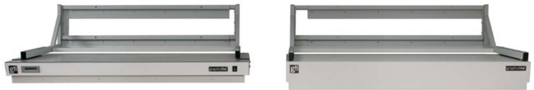
GTI's GLE (left) and GLL (right) series luminaires, shown with wall brackets, are available in 4 and 5 foot models. GLE luminaires have a front power switch and a power cord which plugs into a standard outlet. GLL luminaires must be hard wired into a switched power circuit.