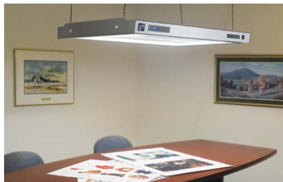
GLE luminaires have a thin profile that is ideal for conference rooms and design studios.