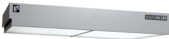
GLL luminaires have a thicker profile and are more suited for production areas. Both are easily hung from a ceiling with chains. GLL models can be installed into a drop ceiling.