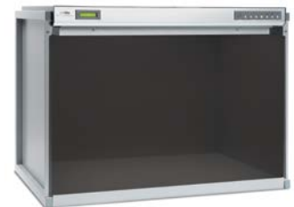
Matte Black Inserts For improved viewing of glossy, highly specular, and dark objects.

GTI is a leading manufacturer of tight tolerance lighting systems for critical color viewing, color communication, and color matching. An in-house spectroradiometric laboratory and a 100% measurement and verification production process guarantees that precision and accuracy is built into all products. All products are shipped with a certificate of product conformance (NIST traceable).