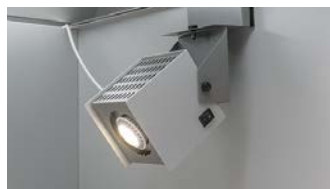
Directional FX Light Available for evaluating gonio-apparent coatings.